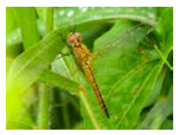
Fig. 5. Pantala flavescens Fabricius