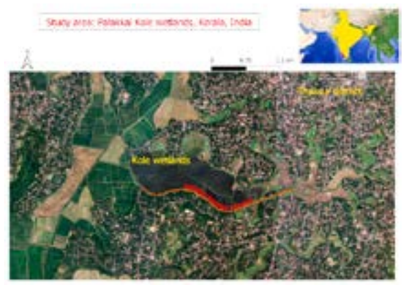
Fig. 1. Study area with Odonata transect: Palakkal Kole wetlands, Thrissur

Palakkal kole wetland was monitored for Odonata diversity. Palakkal is situated at a distance of 6 km from Thrissur, at geographical coordinates of 10°28' 15"N and 76°12' 40"E. The study site (Fig. 2) includes deep and shallow waters, open mud-flats, grassland and paddy fields. It also includes