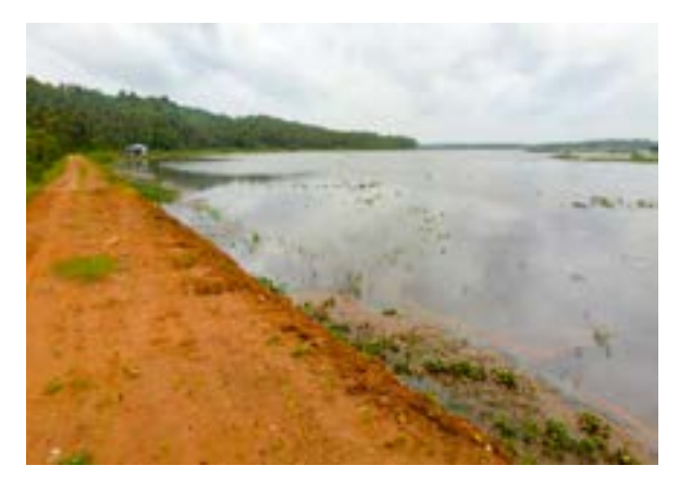
Fig. 2. Study site

bunds, dykes and trees which provide different types of microhabitat for the odonates.